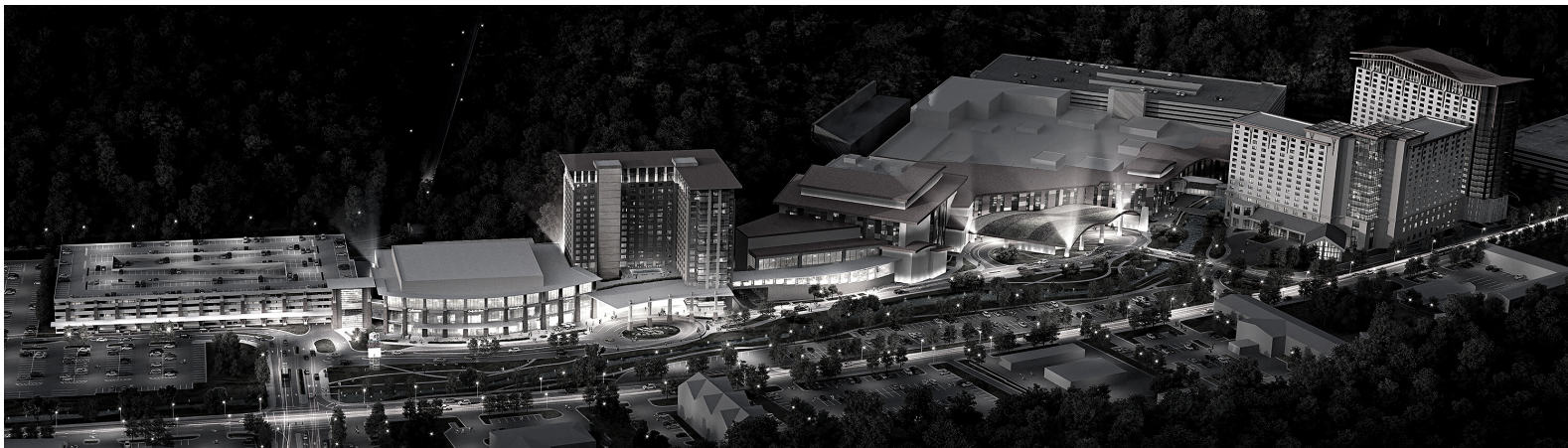
Harrah's Cherokee Casino Resort