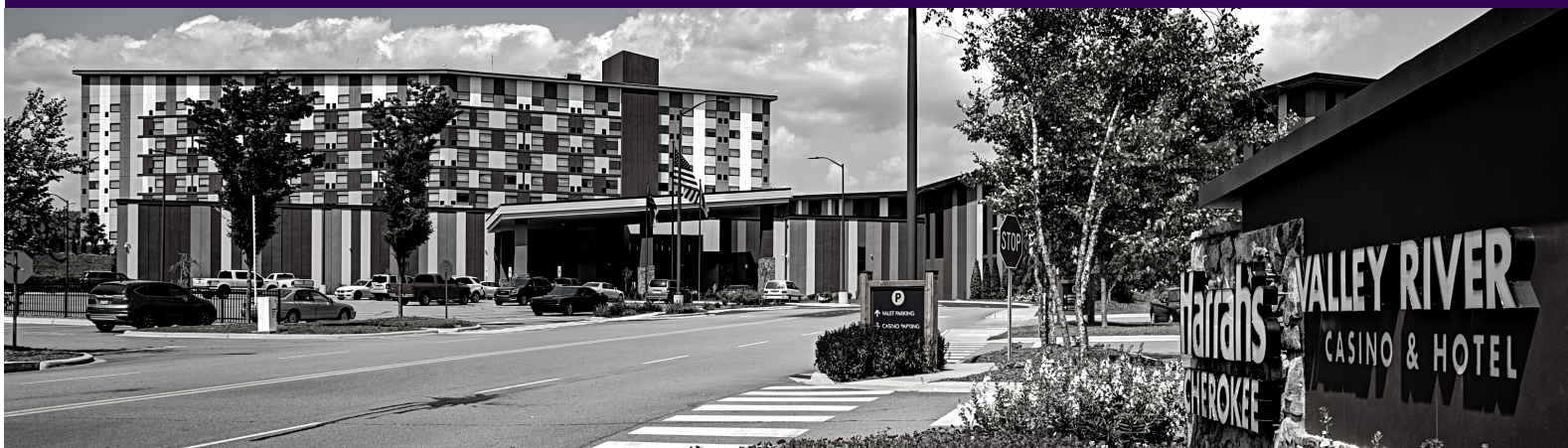
Harrah's Cherokee Valley River Casino & Hotel