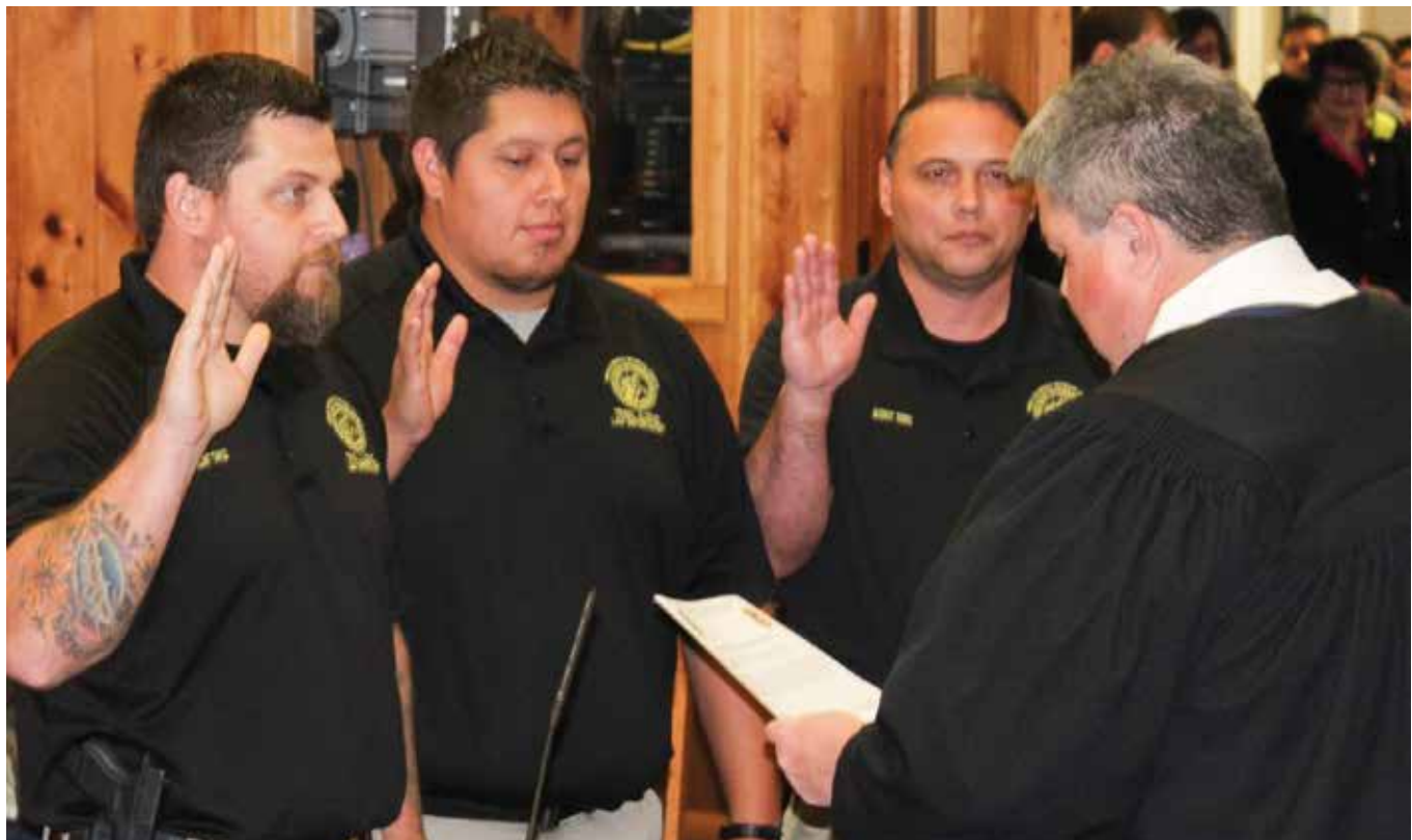
JOSEPH MARTIN/One Feather

Item No. 5: EBCI Governmental Retirement Plan amended so that a participant shall only be vested and