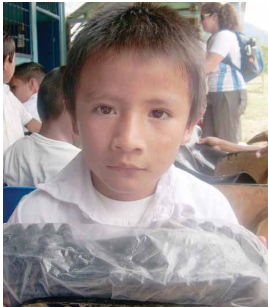
A Costa Rican boy receives rain boots from western North Carolina students participating in the Costa Rica Eco-Study tour in 2011.