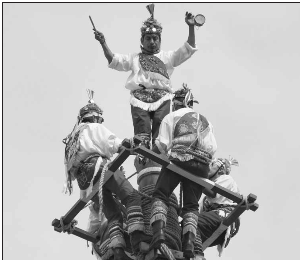
SCOTT MCKIE B.P./One Feather