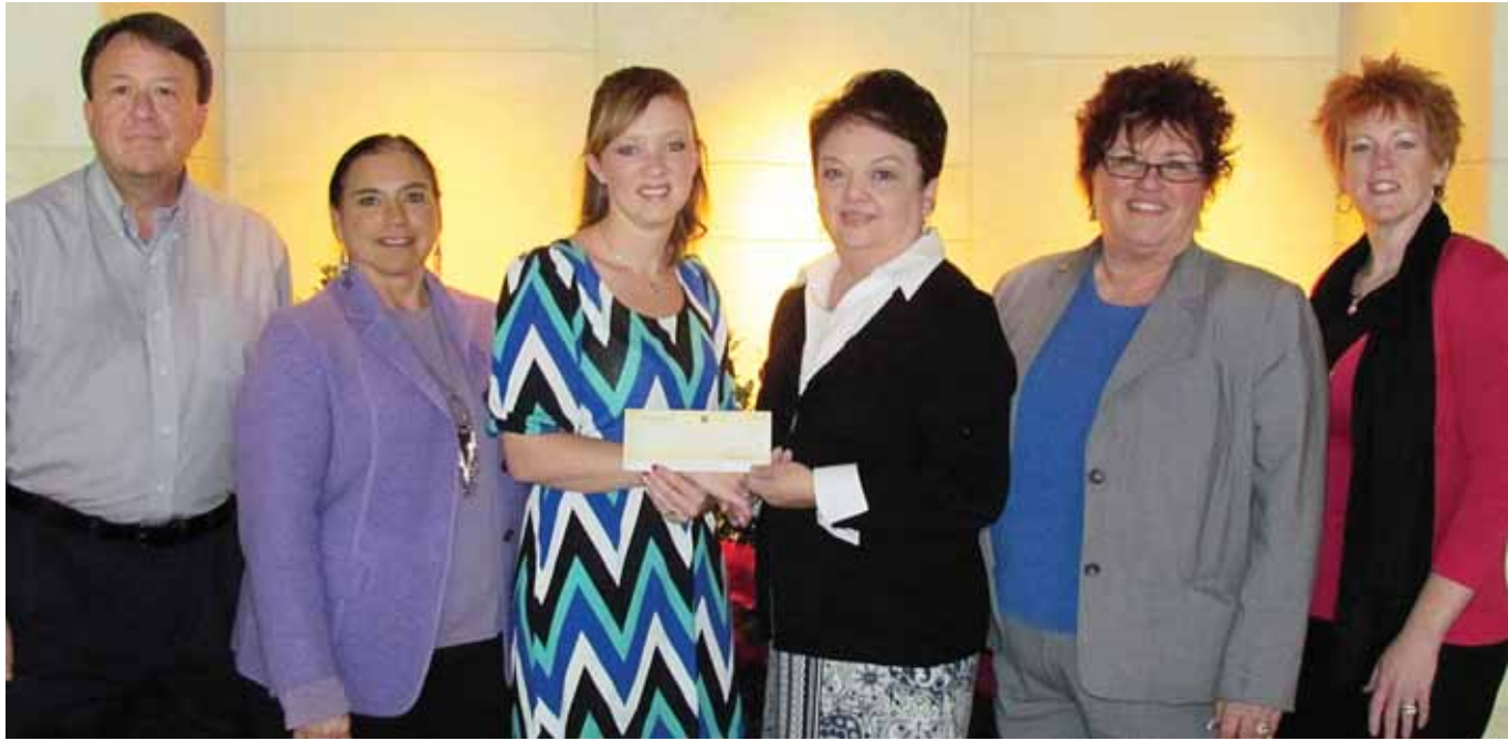
Harrah's Cherokee photos

'Treasure Your Chest' was Harrah's Cherokee's third annual Pink Week event. From learning about breast self-exams on Mammo Monday to participating in a remembrance walk, 'Treasure Your Chest' brought awareness to employees and guests about breast cancer. Harrah's Cherokee senior leadership even strutted on stage in bras decorated by employees at the Beautiful Bra Contest in the Essence Lounge. Employees had the difficult task of voting for their favorite of 36 bras. Everything from a Barbie to a Beanie