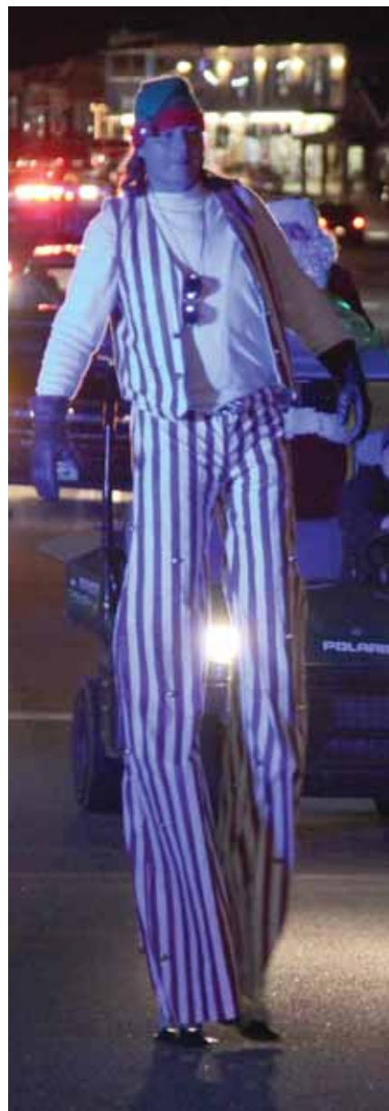
VITA NATIONS/One Feather contributor