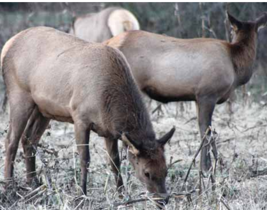
SCOTT MCKIE B.P./One Feather

SUBMIT YOUR PHOTOS TO SCOTMCKIE@NC-CHEROKEE.COM