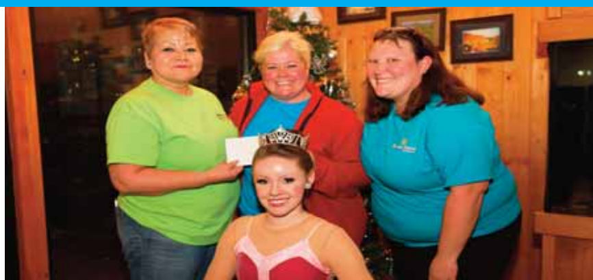
Cherokee Christmas Parade First Place Encore Dance (Above), Second Place Painttown Community Club (below)

These elk were spotted recently in a field in the Yellowhill Community.