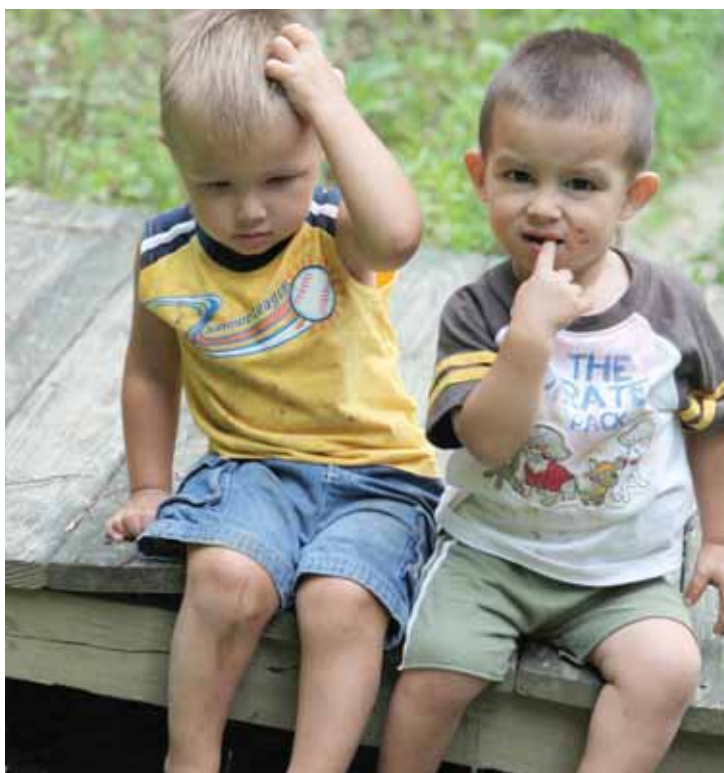
VITA NATIONS/One Feather contributor