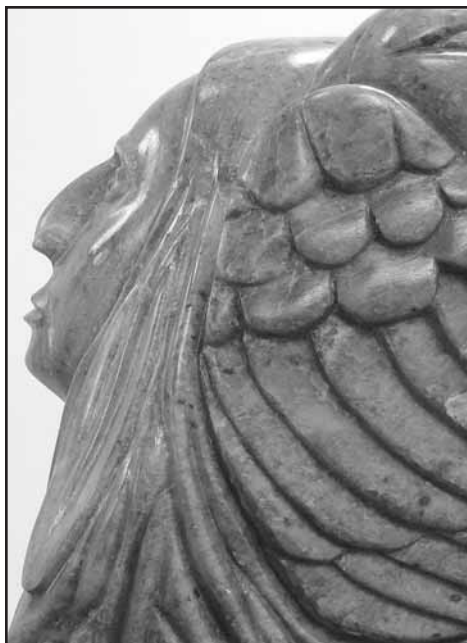
"Shape Shifter", stone sculpture by Amelia Haynes