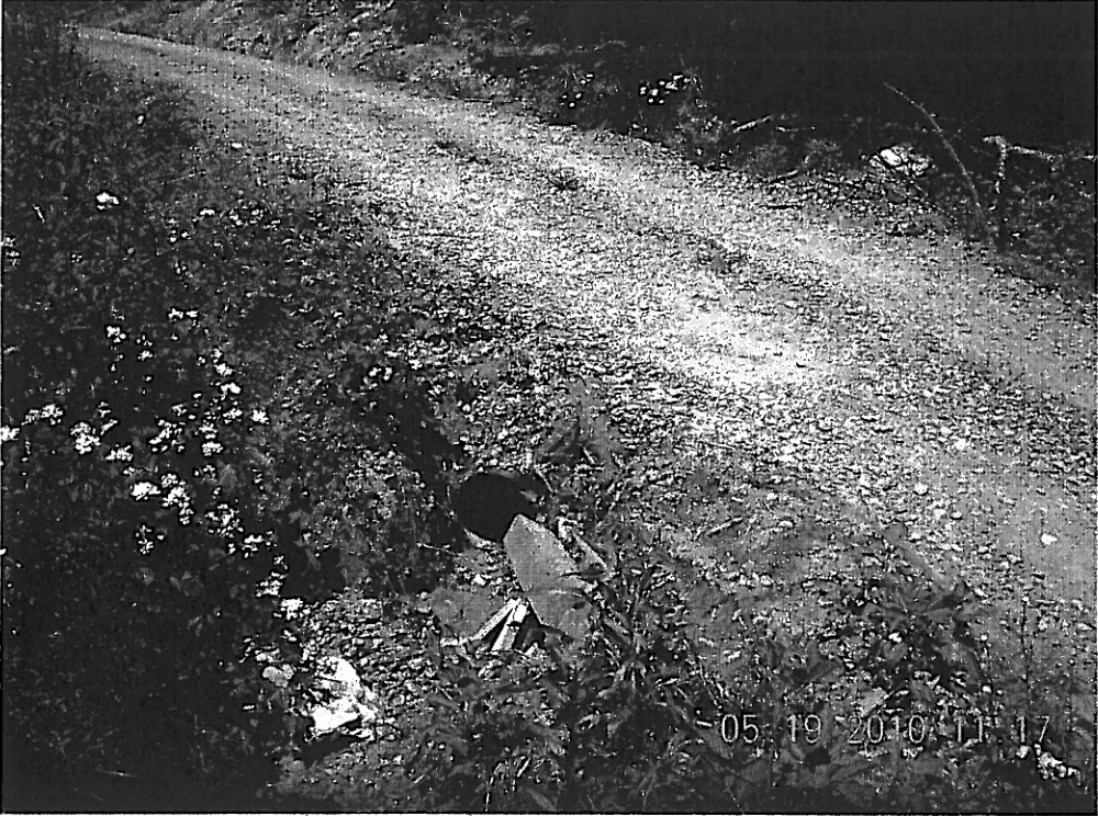
Picture showing location of single cross drainage