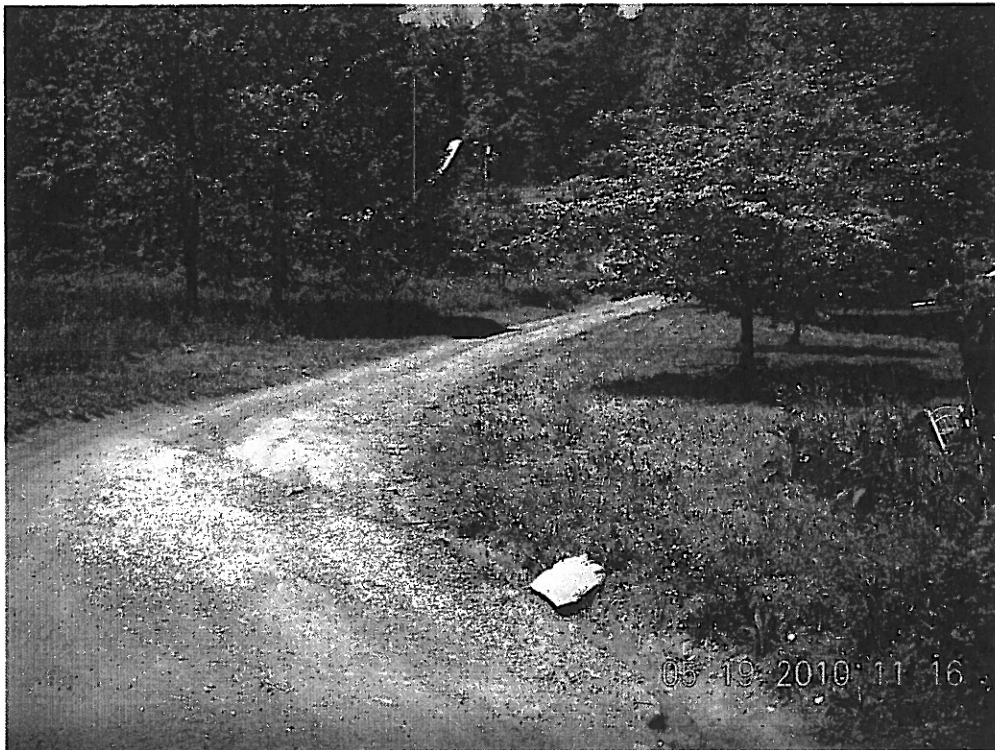
Note continuing erosion due to lack of ditch, driveway is lower than adjacent